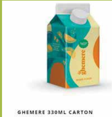
GHEMERE 330ML CARTON